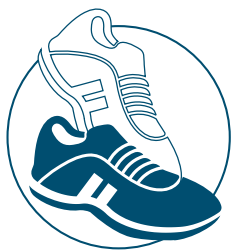
Increase Foot Traffic in Stores

Increase Foot Traffic to Retail Stores • Shift Away from Exclusively Using Traditional Marketing Target Spanish-speaking Families • Boost Online Presence