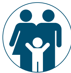
Target Family Demographics